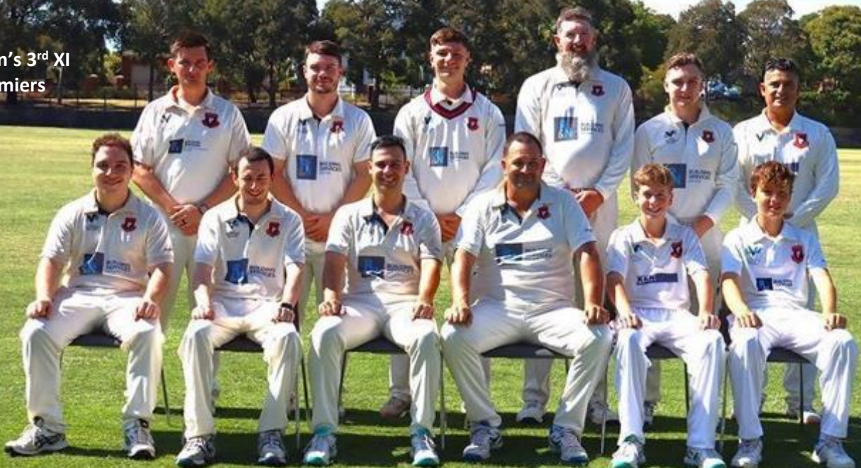
Men's 3 rd XI Premiers